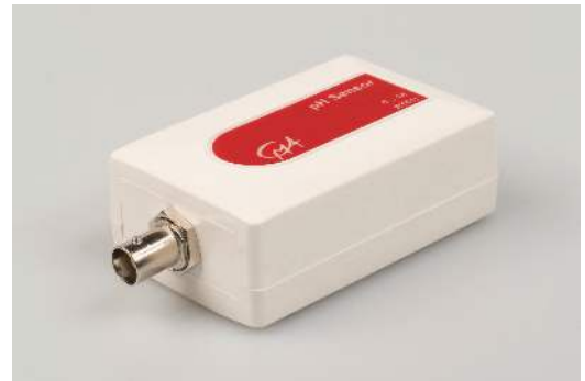
Figure 1. The pH Amplifier (BT61i).

The CMA pH amplifier is a device, which allows a standard combination pH electrode (such as the CMA pH Electrode (031)) to be monitored by a lab interface. The pH electrode is connected to the pH amplifier via BNC connector located on one end of the sensor box. The pH amplifier adjusts the voltage produced by the pH electrode to a range between 0 to 5 V, which can be measured by an interface.