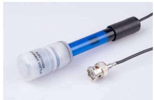
Figure 2. The pH Electrode (031).

The CMA pH electrode is designed to make measurements in the pH range of 0 to 14. It has a coax cable, with a BNC connector. The electrode (made from glass) is built in a plastic tube with an opening at the bottom side. It is supplied in a bottle filled with a protective solution. When the pH electrode is not being used, it must be kept in this liquid. For use and maintenance of the CMA pH electrode follow instructions given in its User's Guide.