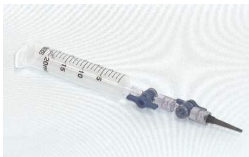
The assembled drop dispenser.