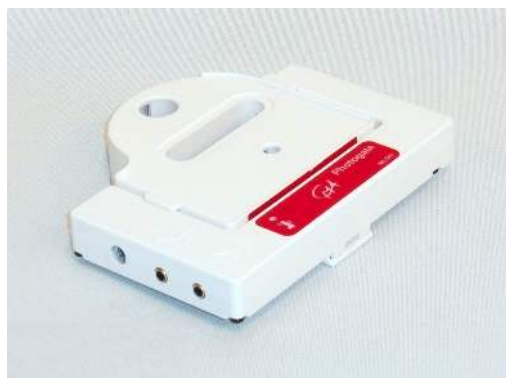
The drop counter attached to the photogate.

For more accurate measurements one can calibrate the drop counter by counting the number of drops to fill a known volume. The volume of one drop can be calculated by dividing the total volume by the number of drops. To perform your own drops-per-mL calibration: