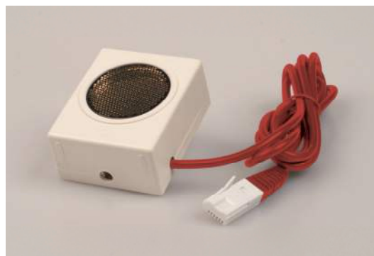
Provided by CMA Motion Detector BT55i has an analog BT (right-handed) plug and can be directly connected to CLAB .

For connecting sensors CLAB has three analog BT sensor inputs with input voltage ranges 0 .. 5 V and -10 .. 10 V. These inputs support all CMA sensors (for a complete list of available CMA sensors consult the CMA website www.cma-science.nl ). Digital sensors, such as a Photogate, a Radiation Sensor or a Motion detector, are provided by CMA with analog BT (right-handed) plugs and can be connected to CLAB .