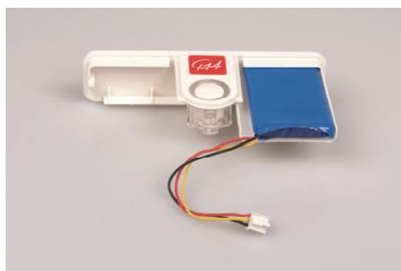
Backside of CLAB with a battery placed in its battery compartment.