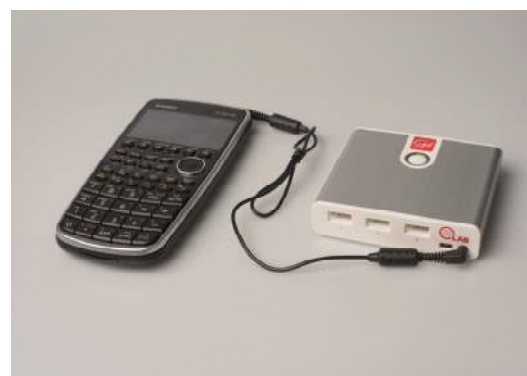
CASIO Calculator fx-CG 20 connected to CLAB via a data communication cable.

CLAB can be used with CASIO Graphic Calculators on which the E-CON program is installed. When connected to a calculator CLAB is controlled by the E-CON program, running on the calculator. The collected data are transferred to the calculator and the measurement can be followed and analyzed on the calculator. To connect CLAB to a CASIO Calculator you need a data communication cable with 3-pin jack connectors. This cable is provided with your CASIO calculator. Detailed information about the use and features of E-CON can be found in the respective calculator manual.